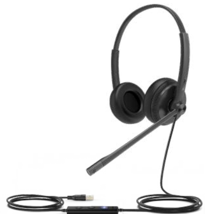
UH34/UH34 Lite Dual Teams UH34/UH34 Lite Dual UC