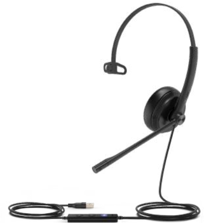
UH34/UH34 Lite Mono Teams UH34/UH34 Lite Mono UC

The hand-held controller with LED indicator provides easier access to key call control capabilities, including answer call, end call, reject call, and mute/unmute.