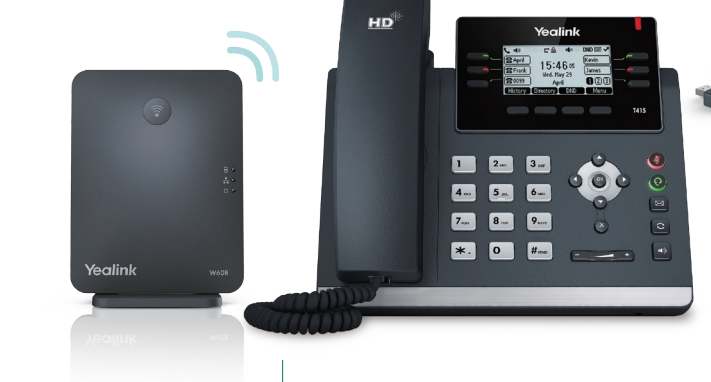
DECT Easy Deployment Technology without Wired LAN